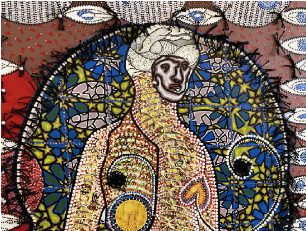
Franklin Williams, "Images of the Heart" (2018) (detail), acrylic, collage, and crochet thread and beads on canvas, 40 x 60 inches