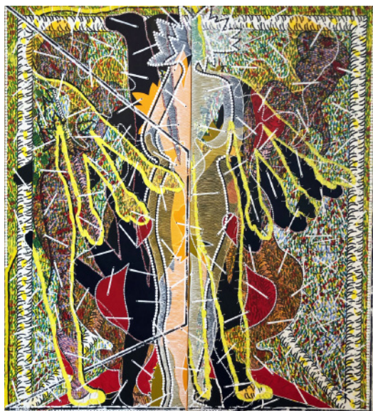
Franklin Williams, "Bodiless and More than a Man" (1975), acrylic and crochet thread on paper mounted to canvas, 67 x 60 inches

Visiting this year's Independent Art Fair was my first experience of New York's art week — a task I approached with trepidation and mild anxiety, having heard horror stories of stifling, overcrowded fairs with lackluster artistic payout. However, I had heard rumblings that Independent was different, with a more manageable exhibitor-list and a more navigable layout. And in fact, I was pleasantly surprised.